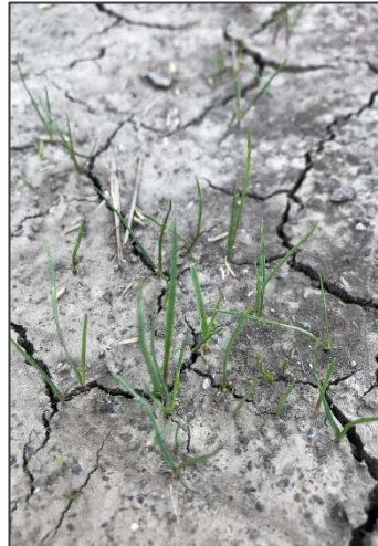
Figure 2. Field trial #1 site photograph showing soil conditions and plant growth six weeks after sowing (August 28, 2019).

Figure 1. Plant growth of grass seed planted on poor quality subsoil collected from the site +/- additional organics (Promix). Seed was untreated or was coated with salt tolerant PGPR prior to sowing. Images were collected on day 6 post seeding.