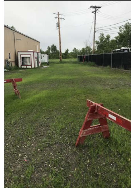
Figure 3. Field trial #2 site photograph showing plant growth six weeks after sowing (June 17, 2020).

Earthmaster was asked to reclaim very poor quality soil on a former construction site and to provide a salt tolerant vegetated area capable of being irrigated with effluent regularly produced from a reverse osmosis water system. The business on-site was a brewery producing large amounts of effluent which the owner wanted to dispose in a sustainable way that did not require the town sewer system. Revegetation of disturbed soils arising from construction related activities can be challenging, especially when surface soil is of poor quality, devoid of organic matter, and is extremely compacted. Earthmaster has developed PGPR (plant growth promoting rhizobacteria) Enhanced Phytoremediation Systems (PEPSystems®) which have been successfully deployed across Canada for treatment of soil contaminated with petroleum hydrocarbons (PHCs), salt, trace metals, and organic solvents. PEPSystems is being adapted for reclamation applications; therefore, Earthmaster conducted laboratory and field trials to assess the ability of PGPR to assist in revegetation of this construction site to assist with on-site effluent management.