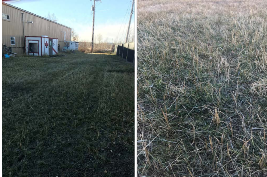
Figure 4. Field trial #2 site photograph showing plant growth at the end of the growing season following 25 weeks of growth (October 30, 2020)..

of PGPR was selected based previous work confirming its ability to facilitate plant biomass production in saline conditions. Results from the laboratory study are shown in Figure 1. Observations indicated the PGPR treated seed showed higher shoot density when compared to untreated seed. The addition of organics to the subsoil did not lead to any observable differences in plant growth; therefore, they were not applied in the field trials.